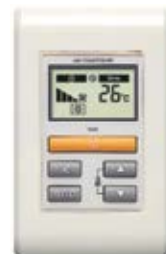
Simple Wired Remote Controller*