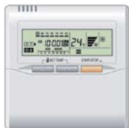
Wired Remote Controller*