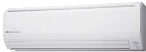
ASTG24 / 30 / 34LFCC